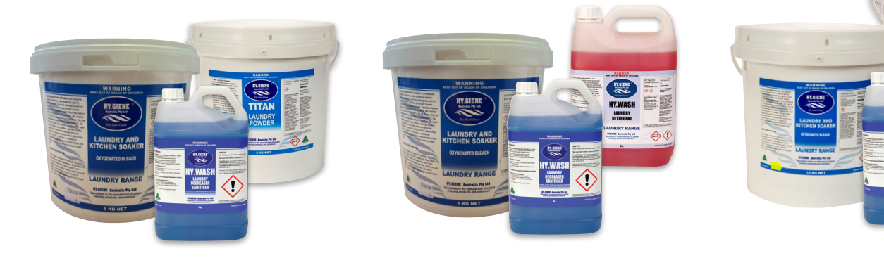
Order Code: 40430 5kg Laundry Powder 5L HY.WASH Laundry Degreaser 5kg Laundry Soaker

Order Code: 40430A 5kg Break Detergent Liquid 5L HY.WASH Laundry Degreaser 5kg Laundry Soaker